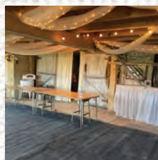
CHARLIE LANE'S BARN