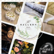
THE GALLERY VENUE BY BRANHAMS