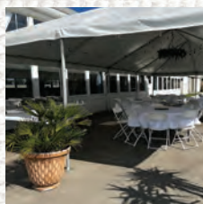
THE DEPOT ON FLETCHER STREET