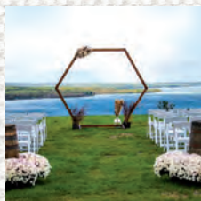
HUBBARD LAKE MT MARIA

Adding new partners daily! Call us today for a full list of preferred off site locations. Each one has its own special charm and ambiance!