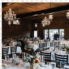
THE BEACH BARN™ AT LAKE LIFE COTTAGES®