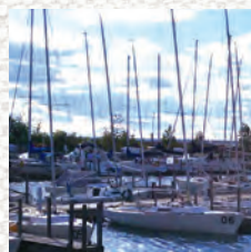
TAWAS BAY YACHT CLUB