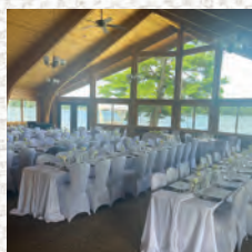
WARRIOR PAVILION @ VAN ETTEN LAKE