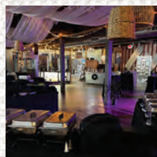
ART IN THE LOFT