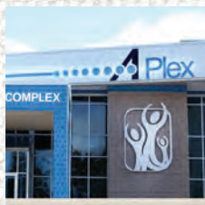
THE APLEX: ALPENA EVENTS COMPLEX